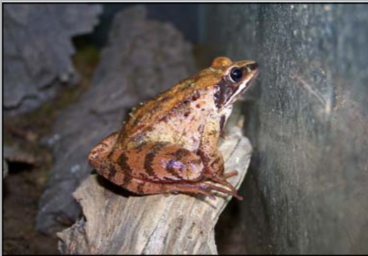
Agile frog ( Rana dalmatina )