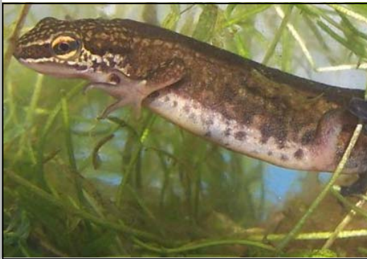
Palmate newt ( Triturus helveticus )