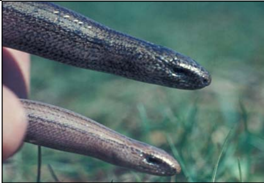
Slow worm ( Anguis fragilis )