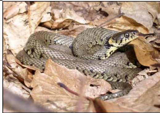
Grass snake ( Natrix natrix )