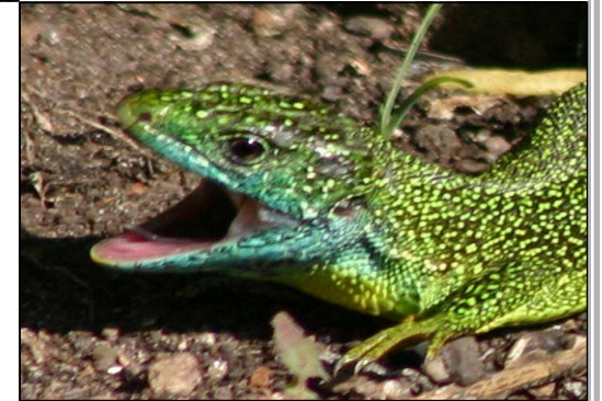
Green lizard ( Lacerta bilineata )