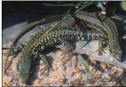
Wall lizard ( Podarcis muralis )